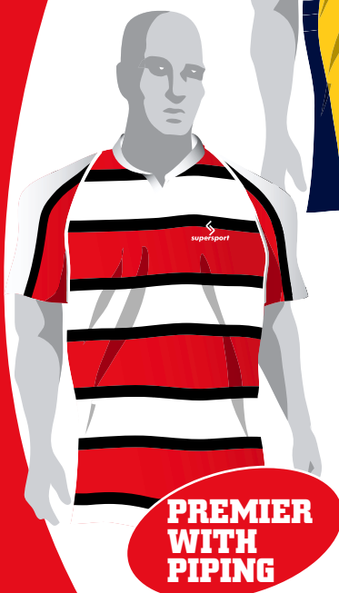
PREMIER WITH PIPING