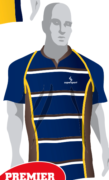
PREMIER WITH PIPING