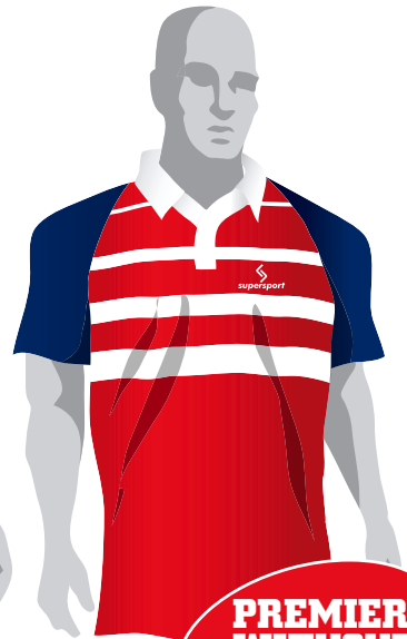
PREMIER WITHOUT PIPING